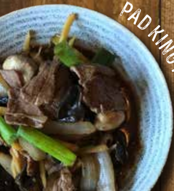
PAD KING NUA