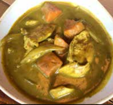
GAENG KARI GAI