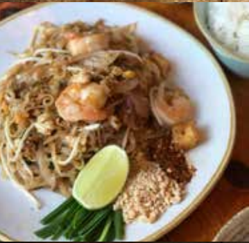
PAD THAI GUNG