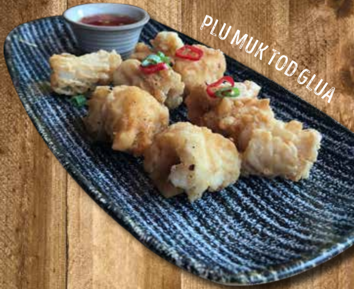
PLU MUK TOD GLUA