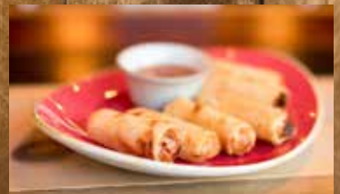
PO PIA JAY